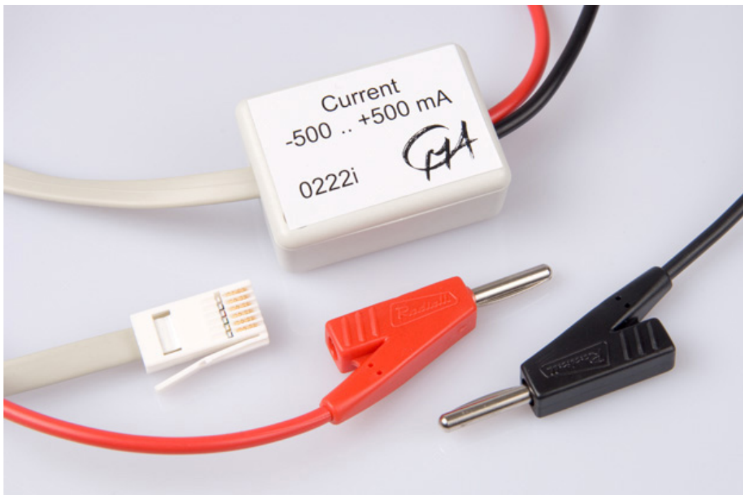
Figure 1. The Current Sensor - 500 .. +500 mA